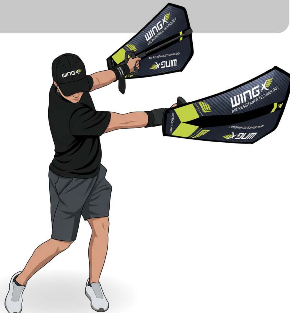
Downswing & Follow Thru